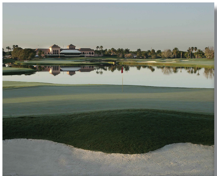
Bear Lakes Country Club