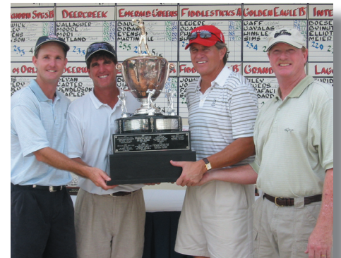
Ponte Vedra Inn & Club defended the Club Team Championship in 2004.

The Championship is set for May 14-15 with the deadline April 20. Get a partner and you will play 18 holes of a two-man scramble and 18 holes of alternate shot. The final day, round three, will be 18 holes of four-ball. This year, the Two-Man Shoot-Out is only gross scoring.